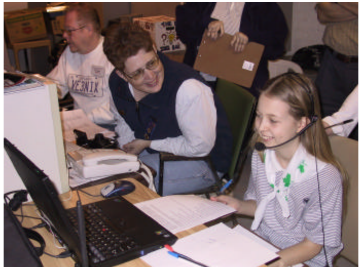
(A guide makes an Echolink QSO)

quickly familiarize the girls with amateur radio.